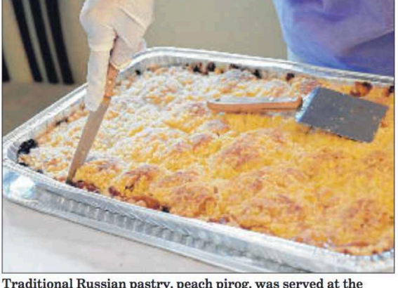
Traditional Russian pastry, peach pirog, was served at the Sept. 29 festival.